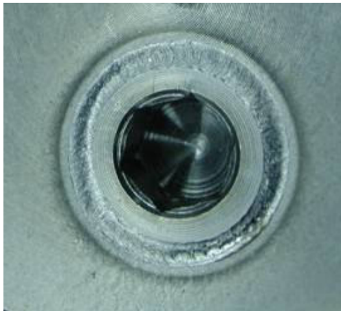
Example of completed weld