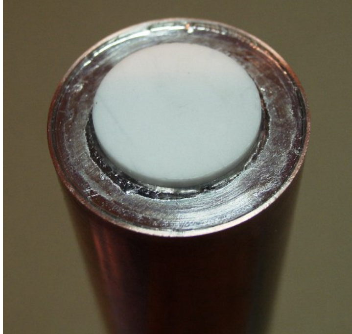
Example of a heavily screened preamplifier for use in electrically noisy locations

Designed for use close to an RF transmitter. The preamplifier was further housed in an electron beam welded and independently grounded outer enclosure.