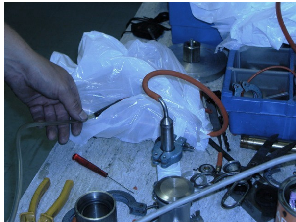
Helium leak detection after welding